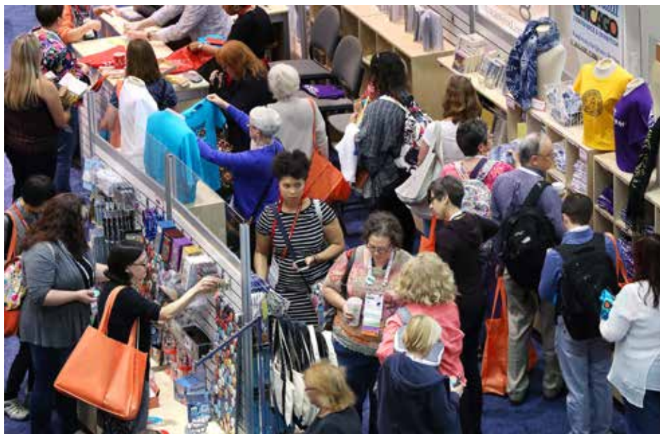
The ALA Store opens Friday, June 21 at 1:30 p.m. in Washington, DC.

The ALA Store will also carry Out of Print's new Star Wars™ READ® Collection. Yoda and Darth Vader tees come from vintage ALA READ® posters from the 80s and 90s. New to the campaign is Out of Print's original Princess Leia READ t-shirt design. T-shirts and socks are available in a wide range of sizes, but shop early for the best selection!