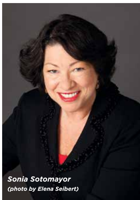
Sonia Sotomayor

Justice Sonia Sotomayor Auditorium Speaker Saturday 6/22, 8:30 - 9:30 a.m.