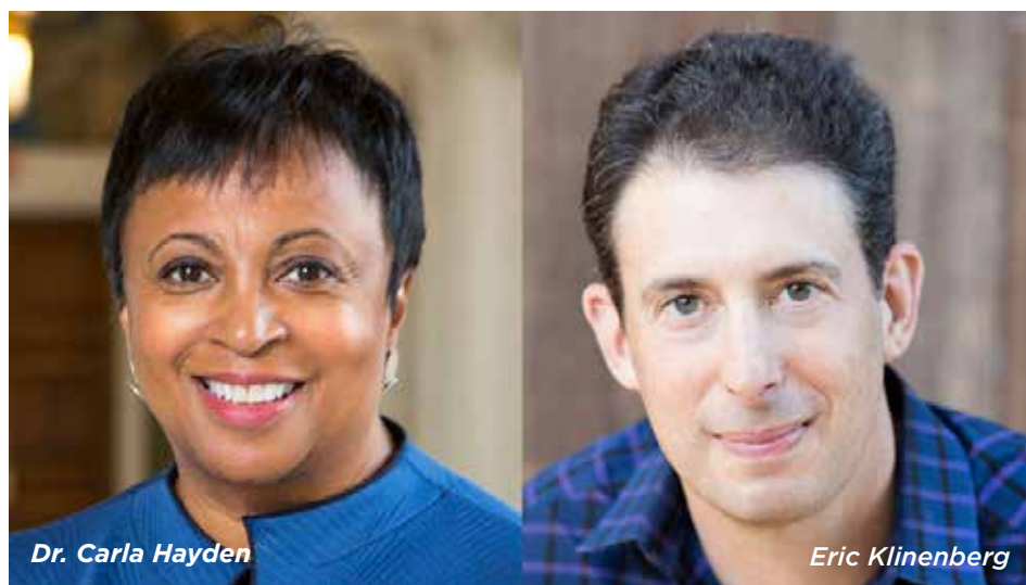
Dr. Carla Hayden