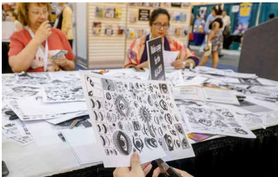
Attendees create zines at the Zine Pavillion in the exhibit hall.

At the Live from the 25 Podcast booth, record a short podcast with an author from the exhibits in a semi-soundproof recording booth.